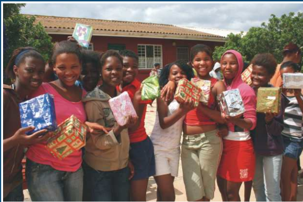
The kids of Missionvale, from toddlers to teenagers, enjoyed Father Christmas' visit on 8th December!

Graduated to Grade 5 and award for literacy, numeracy, neatness and kindness.